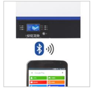
MOBILE MONITORING VIA BLUETOOTH